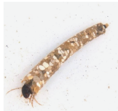
Cased Caddis Fly larva from the River Char