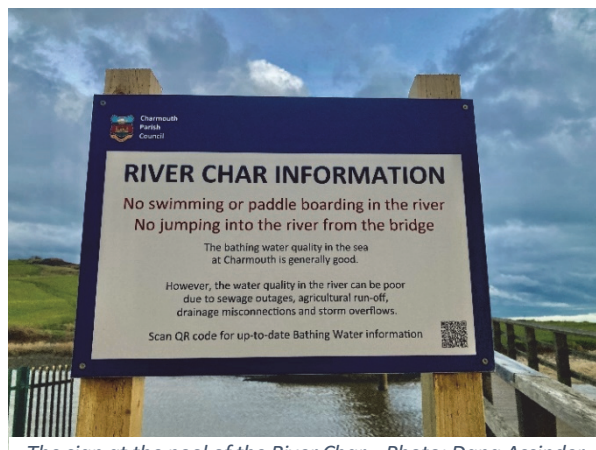
The sign at the pool of the River Char.

The Environment Agency has said it will not re-start testing on the river (although public pressure has led to its testing the River Lim at Lyme Regis). We have asked Wessex Water to test the water in the pool at the river mouth, or support us to do so. We are also launching a campaign via CROWD (Clean Rivers of West Dorset) to get bacteriological tests re-started here and in the pool at the mouth of the River Winniford in Seatown.