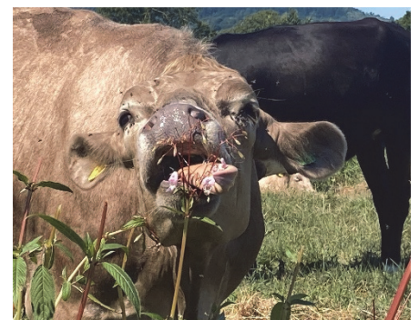
Heifer meets balsam.

↔ Himalayan Balsam: We had a working party to root out Himalayan Balsam at Stockham Bridge in July 2023, when we also discovered heifers are particularly partial to munching on freshly pulled balsam.