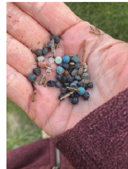
Nurdles and Biobeads in Dana's hand

The HCC has been working on this problem for years and we've also been looking for a way to clean up these microplastics. (They are a serious problem for seabirds, fish and marine animals which like to eat them, cannot digest them and can die as a result.)