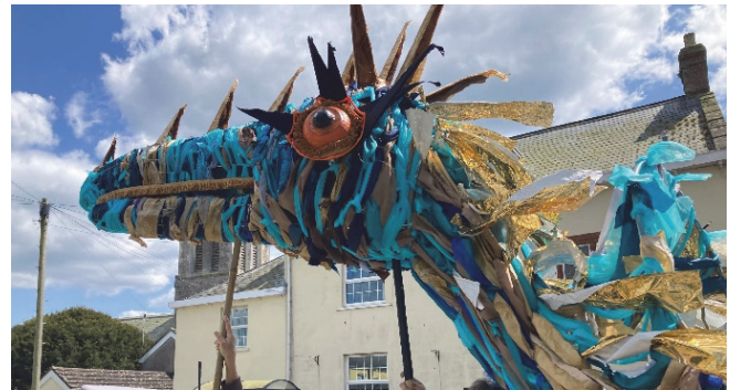
Misty the Charmouth River Dragon

↔ Charmouth River Dragon Festival: We organised this extraordinary community festival last May to highlight the work we're doing on the lower reaches of the river, and on the coast, to address the related issues of flooding, sewage spills, persistent chemicals and microplastics.