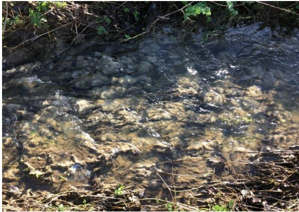
Sewage fungus in tributary of Axe