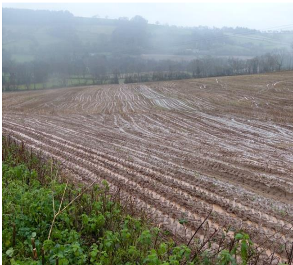
Land compacted from harvesting

Stubble is often used as sacrificial land for winter slurry spreading, providing no agricultural benefit. Stubble is often already compacted from harvesting operations and is compacted further by heavy slurry tankers. Even moderate amounts of rainfall can then generate run-off containing high levels of nutrients flowing into watercourses.