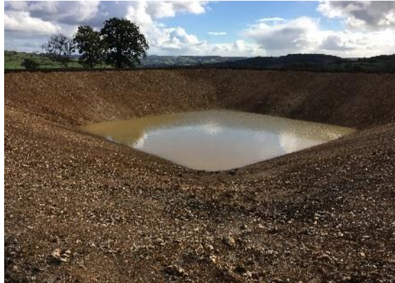
Newly constructed compliant earth banked lagoon