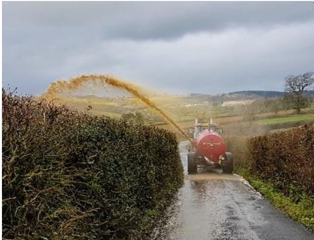
Bad practice slurry spreading likely to be causing pollution

All the farms visited are Red Tractor Assured. The findings of this campaign demonstrate that Red Tractor is not effective at assuring farms are meeting environmental regulations.