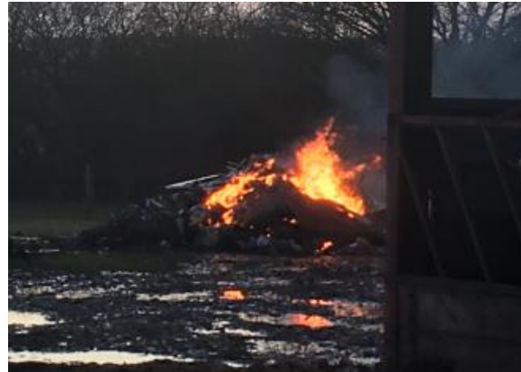
Illegal burning of waste found on 4 farms