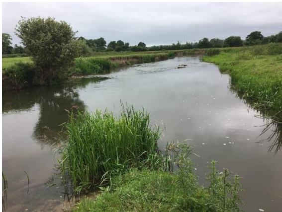
River Axe SAC downstream of Axminster

The dairy sector has high potential to release sediment and phosphorus into rivers. In wet conditions soils in the Axe catchment are vulnerable to compaction from heavy machinery and stock trampling. Applications of slurry on wet spring soils can also result in phosphorus loss when sufficient rainfall occurs within 10-20 days, through preferential drainage, along with ammonium-N and microbial pathogens 1 . When this happens sediment and nutrient run-off will often result. Approximately 80% of the land consists of heavy clay soils, is poorly draining, unsuited to growing maize and to winter manure spreading but these activities are widespread.