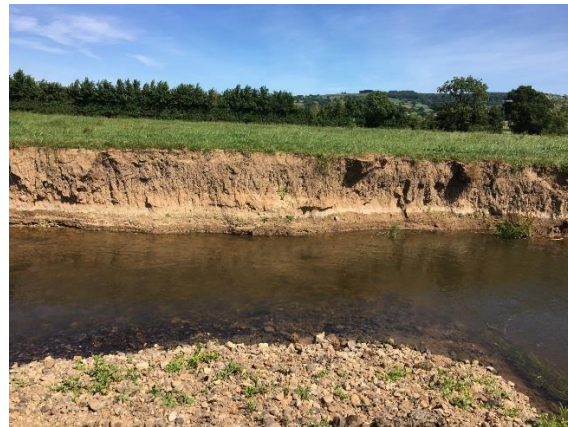
The River Yarty near the River Axe SAC confluence with severe bank erosion, sediment pollution and loss of water plants

Some dairy units will take a cut of grass from temporary grass leys prior to drilling a maize crop. This delays drilling operations until mid-late May, some 3-4 weeks after the earliest sowing opportunity in a normal year. Any delay in drilling can have knock-on effects later in the year, especially if the autumn is wet. Wet conditions stop the crop from ripening, delaying harvesting operations further. These wet conditions make heavy soils very vulnerable to compaction. Wet heavy soils are very difficult to manage without causing pollution and establishing a crop or preparing the land for winter are both very high risk.