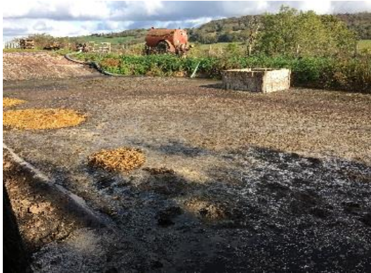
Non-compliant weeping wall store

to avoid spreading during the winter on land sensitive to compaction and at risk of run-off.