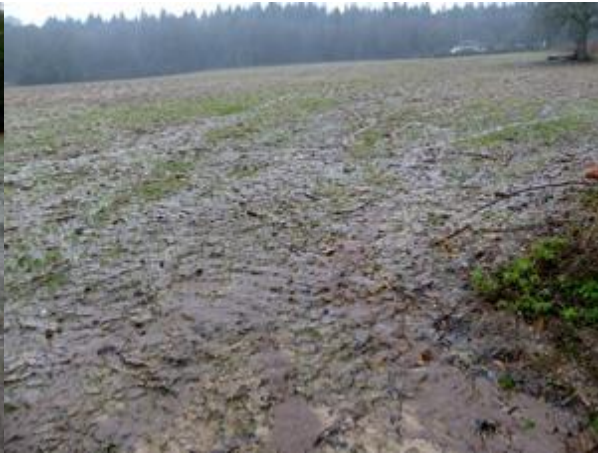
Direct Drilled grass reseed with slurry run-off

Stubble is often used as sacrificial land for winter slurry spreading, providing no agricultural benefit. Stubble is often already compacted from harvesting operations and is compacted further by heavy slurry tankers. Even moderate amounts of rainfall can then generate run-off containing high levels of nutrients flowing into watercourses.