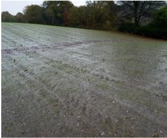
Poor Grass reseed