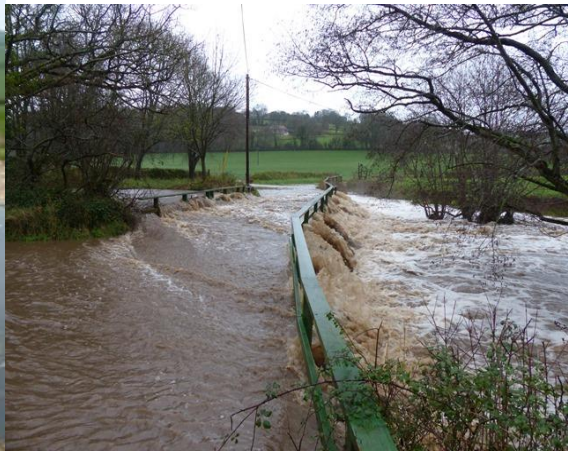
Beckford Bridge (River Yarty in spate)