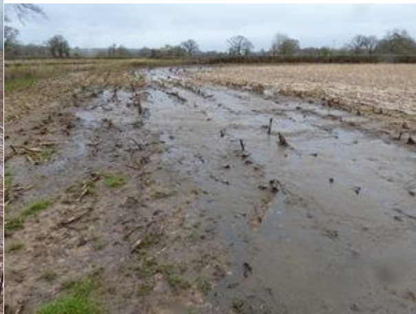
Winter slurry spreading on stubble

Agricultural intensification has also resulted in physical changes in the river system as run-off has increased leading to the river coming out of regime. Severe bank erosion and the loss of many riparian trees is evident in much of the catchment. River channels are becoming more incised releasing more fine sediments from the banks. New run-off pathways caused by compaction will form after agricultural operations and in heavy rain these can create new flood problems for roads and properties. This is likely to be exacerbated as the climate changes.