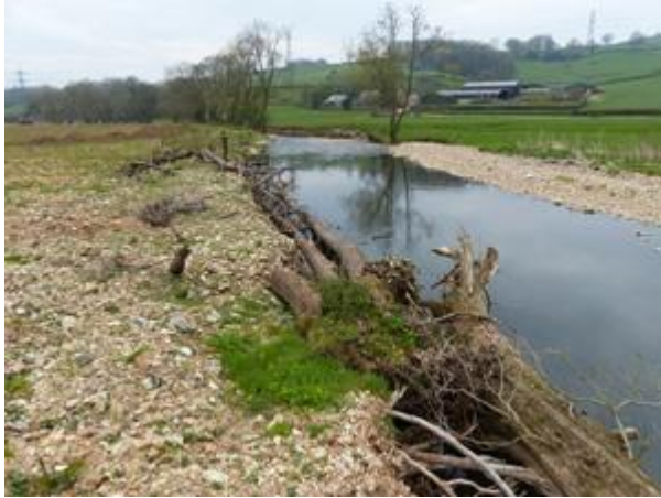
River Yarty after Spate