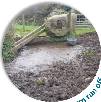
Farm run off

Pollution may enter rivers from a number of farm sources (e.g. slurry stores, yards), which often contain nutrients and chemicals. Chemicals may be toxic to wildlife, while nutrients can result in excessive algal growth. As this algae decomposes, the oxygen levels in the water are reduced, which is very harmful to fish and other wildlife.