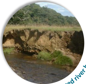
Collapsed river banks

As well as from the land surface, sediment may be eroded from the river banks themselves. River bank erosion is natural, but this process can be accelerated by certain land uses and vegetation.