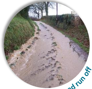
Road run off

Road surfaces are generally impermeable, allowing rainfall to flow rapidly across them. As water crosses roads, it may pick up fuels, heavy metals, micro-plastics and litter, delivering them to the river.