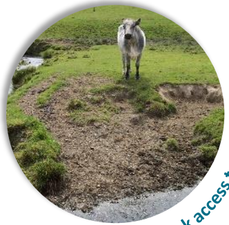
Cattle/ stock access to river

When stock have direct access to the river, soil and sediment is mobilised as they trample on the river banks, and their waste can introduce microbial pollution. Hoof marks down to the river are a good indicator of stock access.