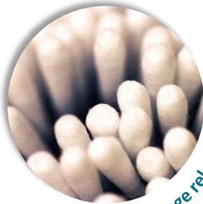
Sewage related litter

There are some types of pollution which are clearly visible, or their effects are clearly visible, but their source cannot easily be identified or the source may be evident but not currently active.