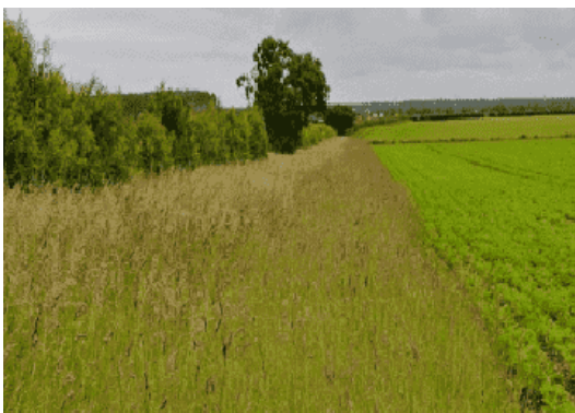
A buffer strip in action

9. West Dorset's banked Saxon hedges (like those elsewhere in the Southwest) were probably planted on banks for multiple reasons: the bank helps to make an effective livestock-proof barrier; it provides shelter against the wind for livestock and crops; it helps to control soil erosion and surface runoff; the ditches on either side (dug out to form the bank) help to drain the fields on either side. We saw a newly planted banked hedge at New House farm, put in with help from Dorset Wildlife Trust volunteers and Dorset AONB.