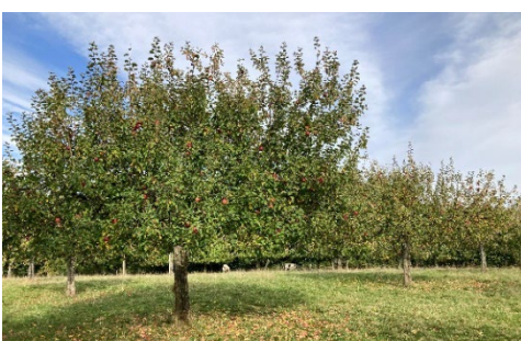
The orchard at Crabbs Bluntshay

4. The electricity pylons in the Char Valley have a lot going for them. The National Grid's Landscape Enhancement Initiative (LEI) is a grant scheme designed to reduce the impact of electricity transmission lines in England and Wales. LEI funding is available for AONBs and Dorset AONB has been able to use its share to support woodland and orchard planting, river management and hedgerow planting schemes on all three of the farms we've visited recently. Without the pylons, those smallholdings might never have received the investment of money and labour.