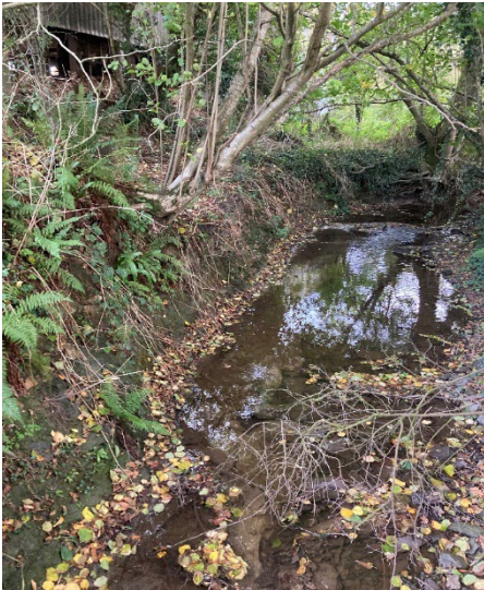
The meandering river at Crabbs Bluntshay

1. An oak tree in the middle of a field (and we saw many in the distance from Crabbs Bluntshay) often suggests the line of an old hedge. The loss of about 50% of hedgerows since World War II was driven by Government funding to farmers who grubbed them up. Recently, funding has been available to encourage farmers to replant hedges. (In a reminder that fake news is nothing new, a 1969 botanical study estimated hedgerow loss at 10,000 miles per year – as opposed to the then government's estimate of 500 miles per year).