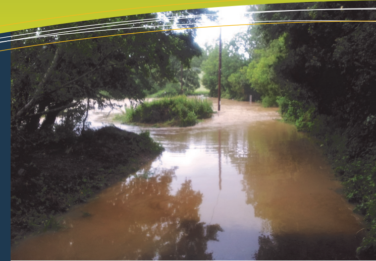
Flood at Becklands Lane, Whitchurch (06.07.12)